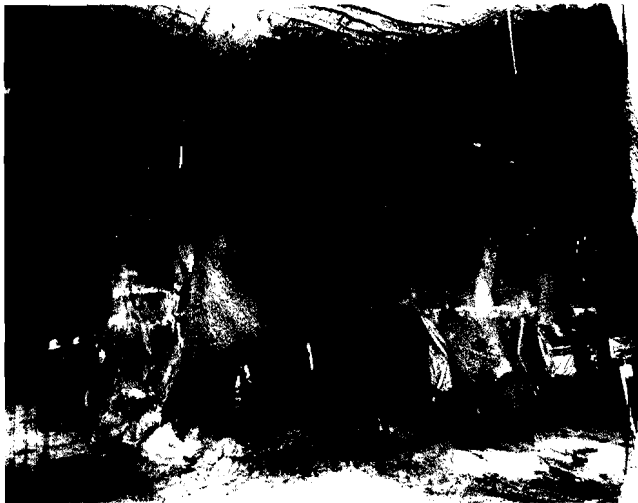
View of test tunnels at Yucca Mountain

uranium hexafluoride ( Follow-up of Depleted Uranium Hexafluoride Conversion , IG-0751, December 2006). We found that the Department had, in fact, performed an analysis in May 2005 that showed that adding the fourth line to the Portsmouth facility could result in the estimated savings indicated in our previous report. However, the Department had not taken the next step to implement the most cost-effective approach to converting depleted uranium into a more stable form. Despite the passage of time, we found that the Department could still save $35 million in lifecycle costs by reducing the operations schedule by approximately five years through the utilization of a fourth conversion line at the Portsmouth facility.