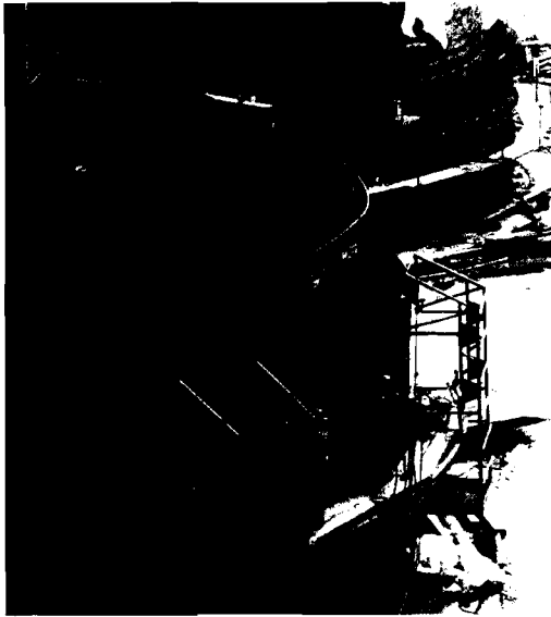
Cleanup of waste tanks at the Hanford Site

While these corrective actions are positive, recent OIG reviews have identified additional improvements that are necessary to ensure that the Department's efforts to implement project management principles are effective. For example, in one of the largest and most important of its environmental remediation projects, the Department is constructing a Waste Treatment Plant at the Hanford Site. The $12.2 billion facility is designed to treat and prepare for disposal of 53 million gallons of radioactive and chemically hazardous waste. Given its classification as a Category II nuclear facility, the Waste Treatment Plant must meet quality assurance standards for nuclear facilities, which significantly exceed those required for commercial facilities. As a result, the design called for the installation of a computerized integrated control network to monitor the operation of a number of key processes of the Plant.