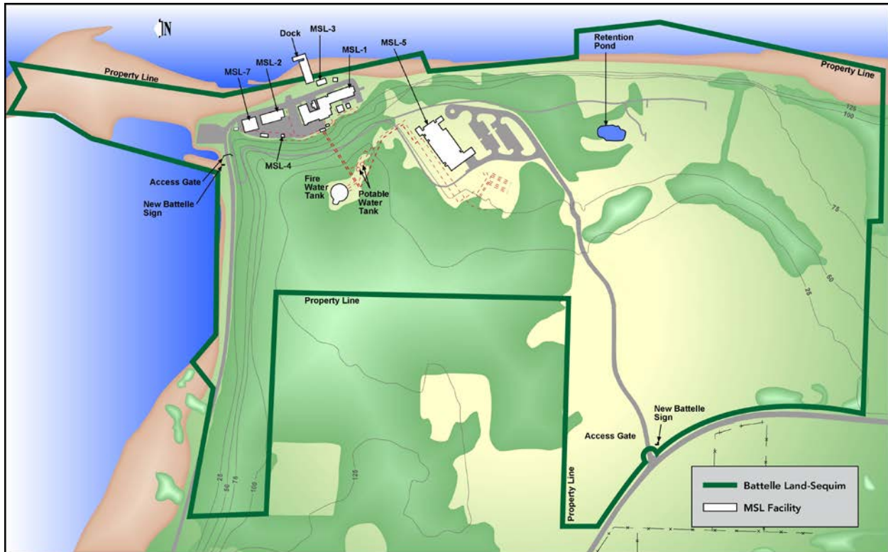
Figure 1.2. Battelle Land-Sequim and Marine Sciences Laboratory

Battelle Land-Sequim on Washington State’s Olympic Peninsula is the site of DOE’s only marine research laboratory. It lies on the shores of the Strait of Juan de Fuca and is in the rain shadow of the Olympic Mountains in Clallam County at approximate coordinates 48°04’40” N, 123°02’55” W. Despite its coastal location, it receives less than 15 inches of rainfall on average annually. Average monthly temperatures range from 31°F to 70°F. Nearby cities are Sequim (population 6,600), Port Angeles (population 19,000), and Port Townsend (population 9,100) (DOC 2011). Seattle is approximately 50 miles (mi) from MSL. The nearest sea border with Canada is about 17 mi from MSL in the Salish Sea; the nearest Canadian land border is about 25 mi northwest from MSL.