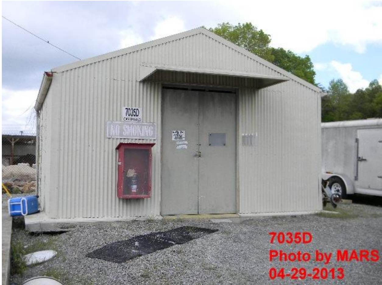
7035D-Pipe Insulation Storage