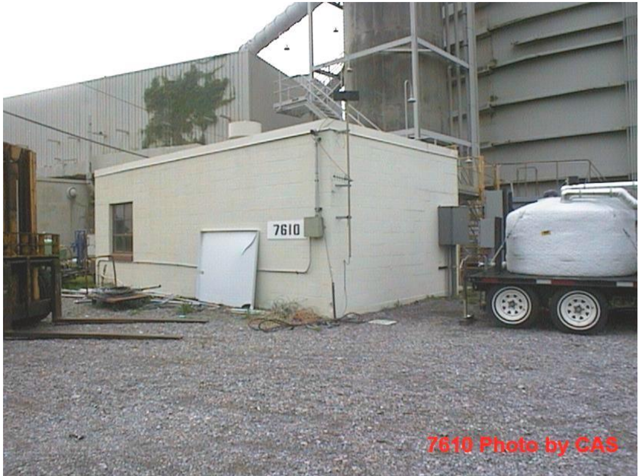
7610 Energy Systems Area Storage Building