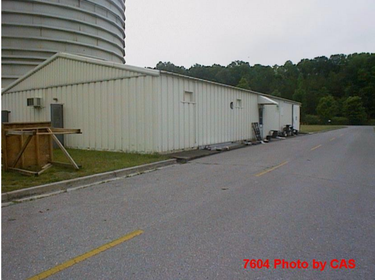
7604 Utility Building