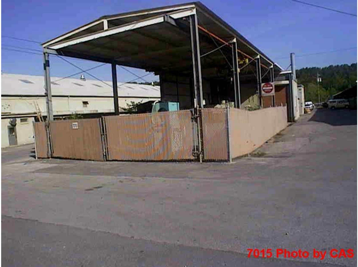
7015-Metal Storage & Cutting Facility