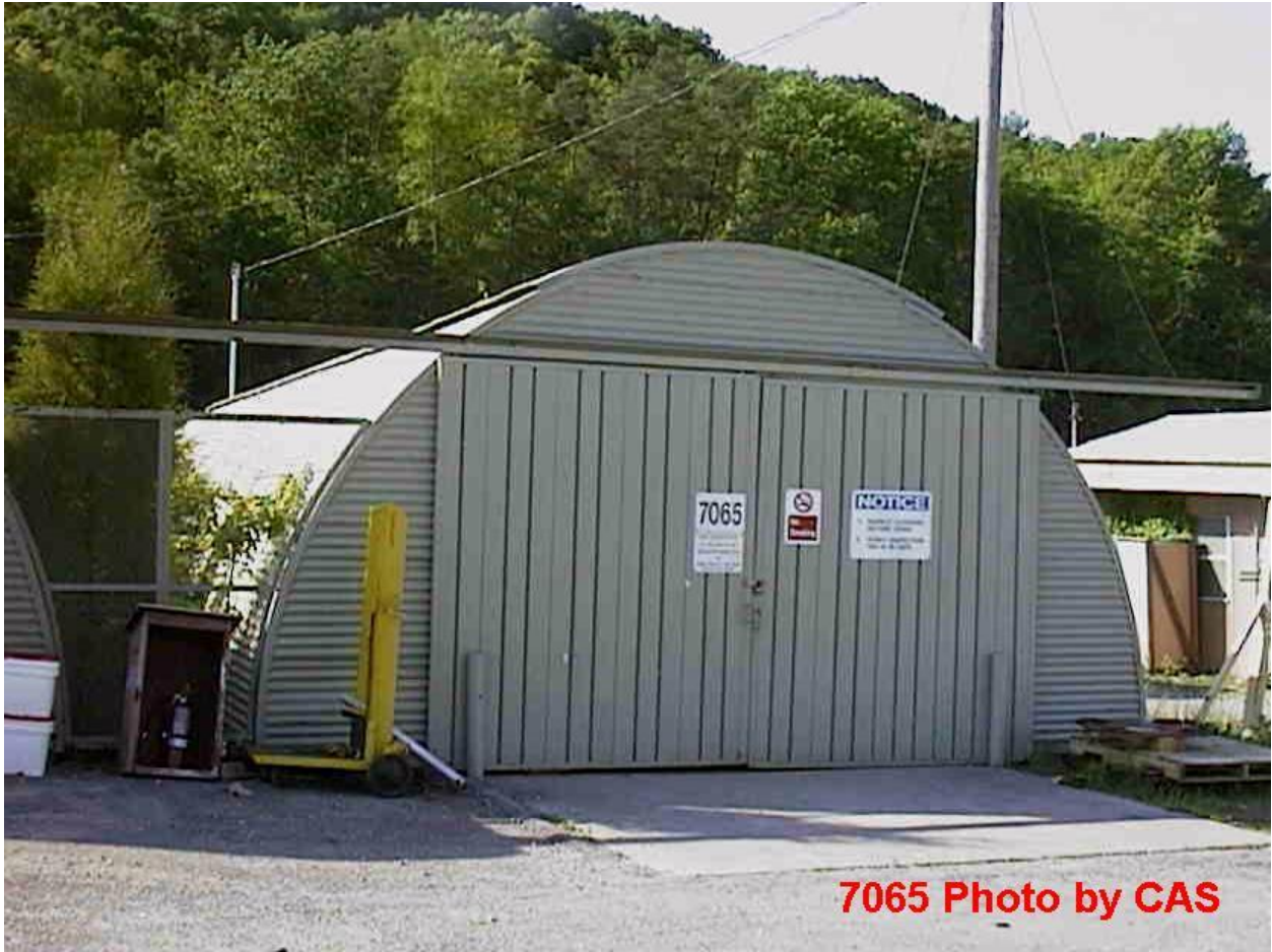
7065 Rigger Equip Storage