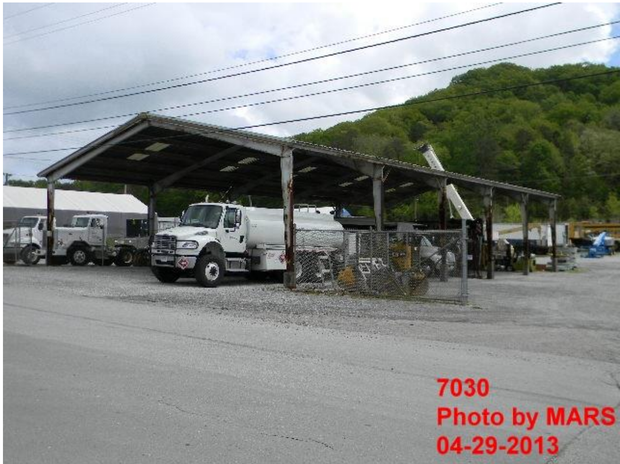
7030-Heavy Equipment Storage Shelter