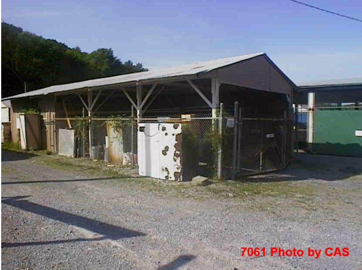
7061 Health Physics. Environmental. Storage.