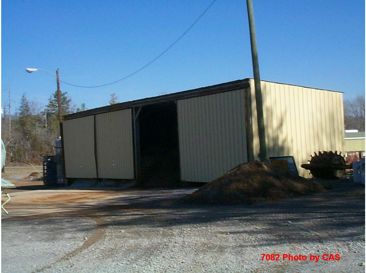
7082 Salt Storage Building