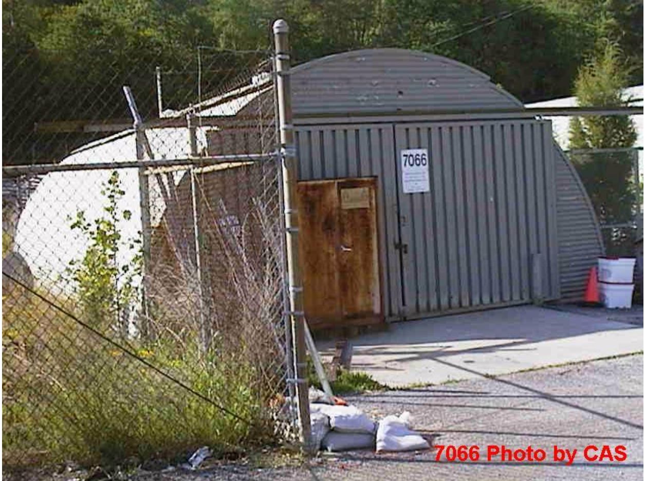
7066 Grounds Maint.Storage