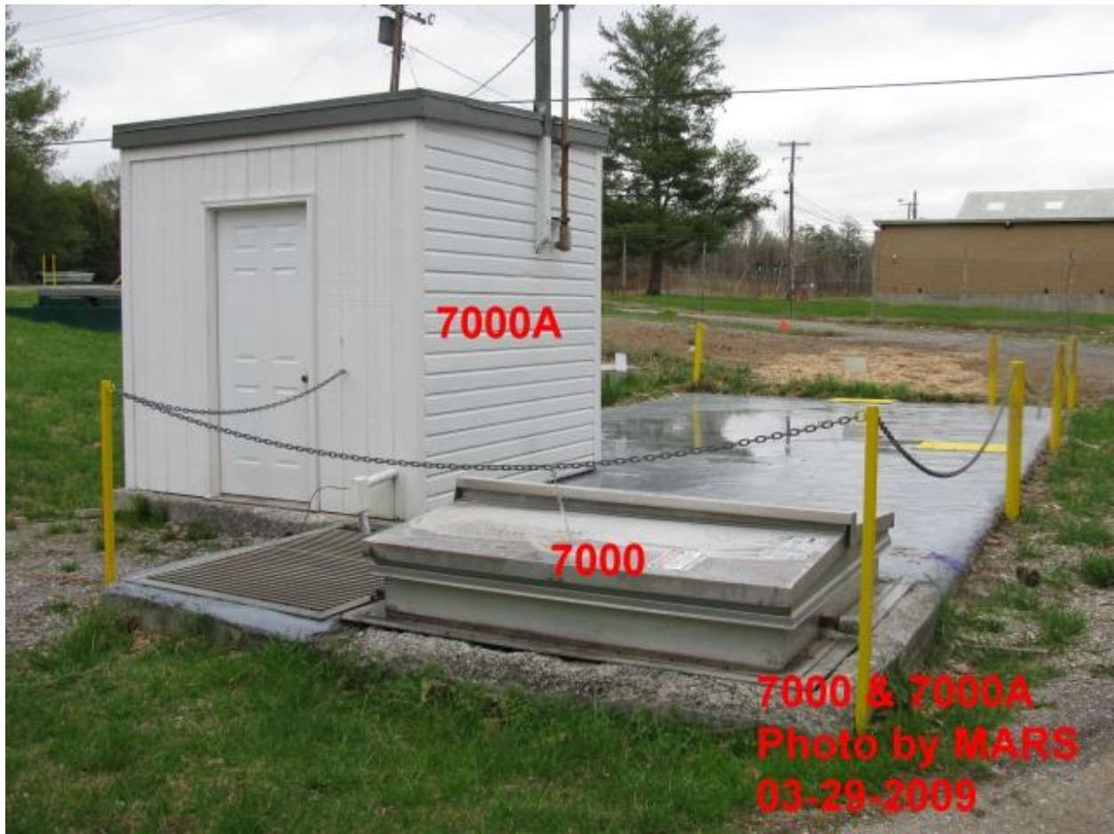
7000 Septic Tank for 7000 Area